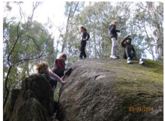
Climbing the big Rock – of which there were many