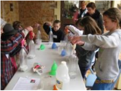
Testing air pressure