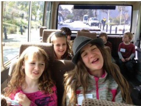
Fun on the bus