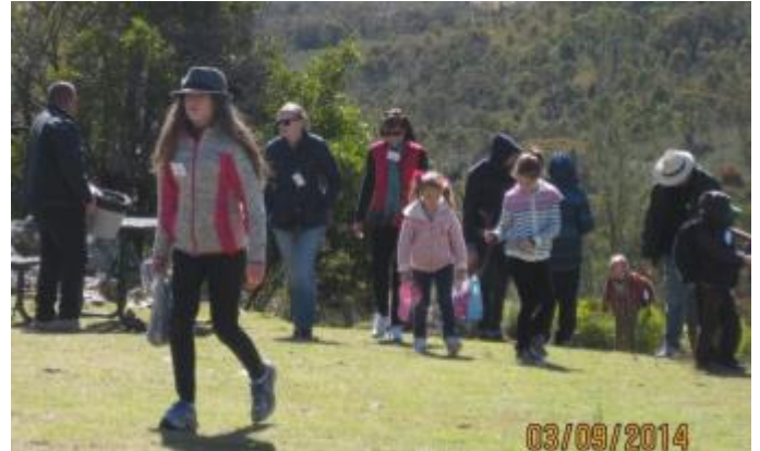
At Tidbinbilla - a beautiful, sacred and peaceful area

family and cultural connections from which we could learn. We enjoyed each other's company and practiced our life rules to live by – particularly being birds together.